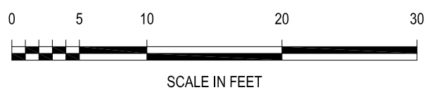
SCALE IN FEET